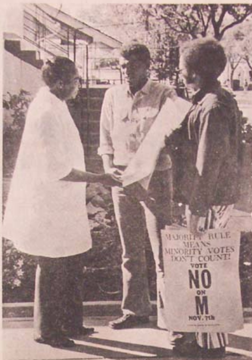
Under Measure M, there would be a run-off election if no candidate received 51% of the vote. This would rob Black people of our voting power.

Black people have always been without proper representation in government, largely due to the methods employed by the power structure to prevent us from taking part in the political process. The brutal lynchings, hooded Klansmen patrolling the polling places, poll taxes, and discriminatory literacy tests are vivid examples of the racist practices previously used to stop Blacks from voting. But those determined to keep Black and other oppressed people from exercising their right to vote are now using new, more sophisticated tools of disenfranchisement (to deprive us of the right to vote).