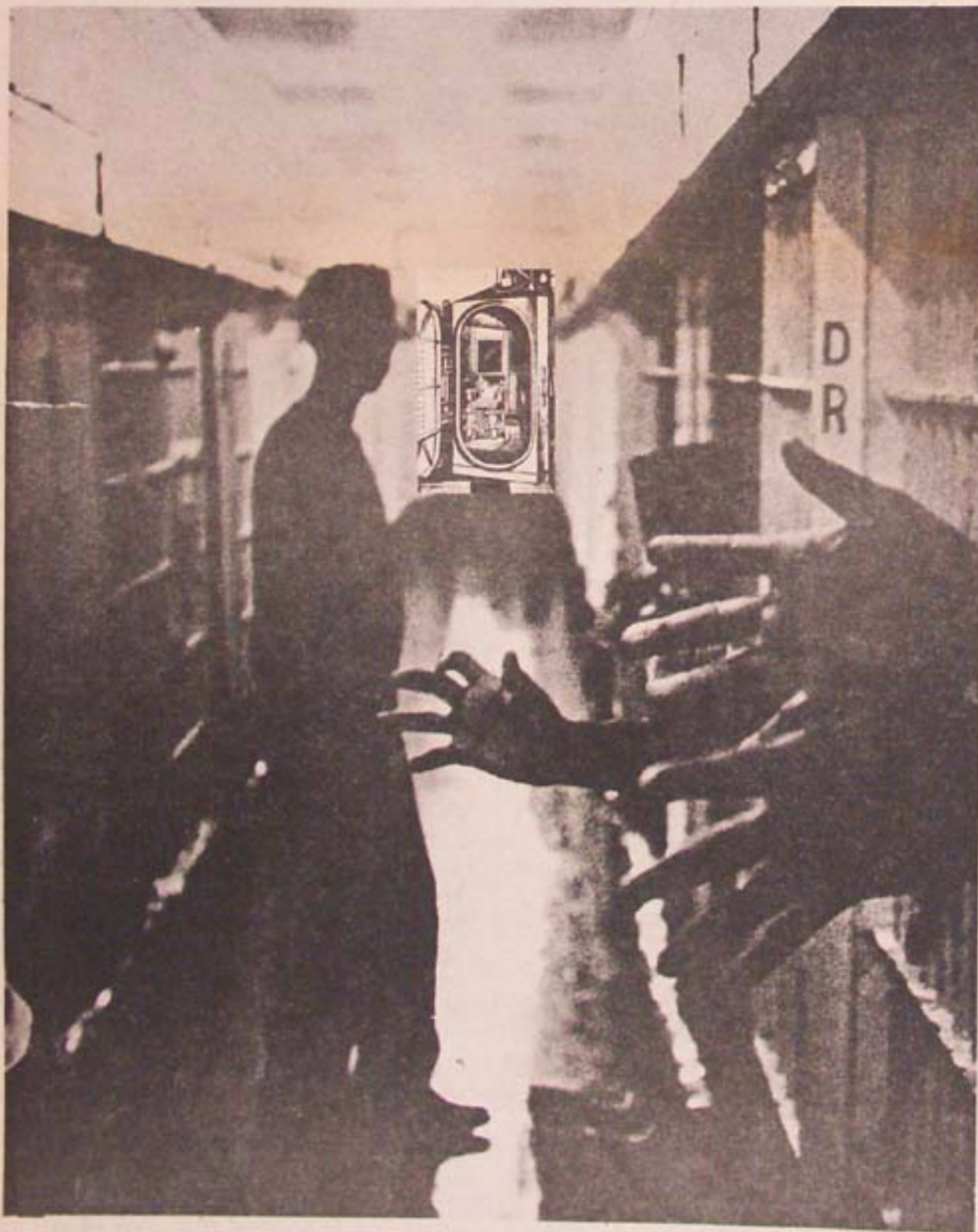
Passage of Proposition 17 would have the effect of returning thousands of Black and poor prisoners to Death Row.

Thus, sick men like Arthur Bremer, the man who attempted to assassinate George Wallace writes: "Really would feel better if Michl- CONTINUED ON PAGE 12