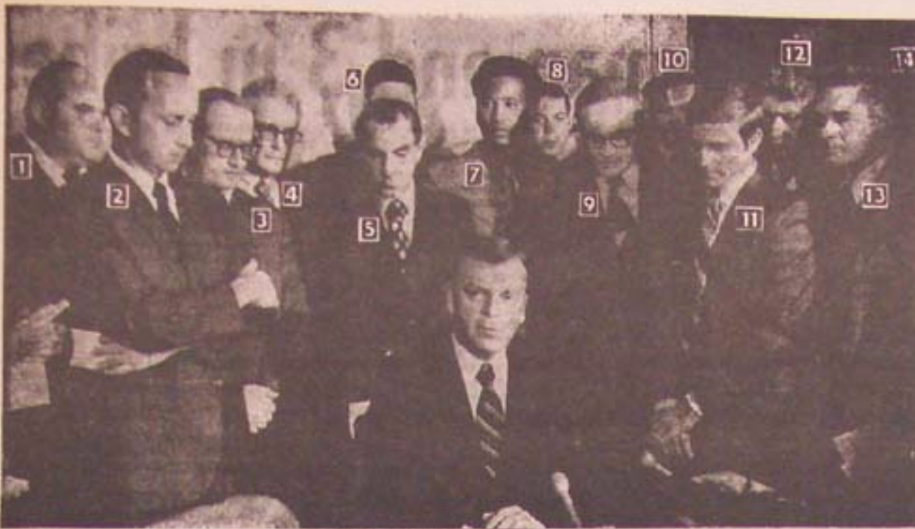
The court protected its own by finding Hanrahan and the 13 policemen "not guilty".