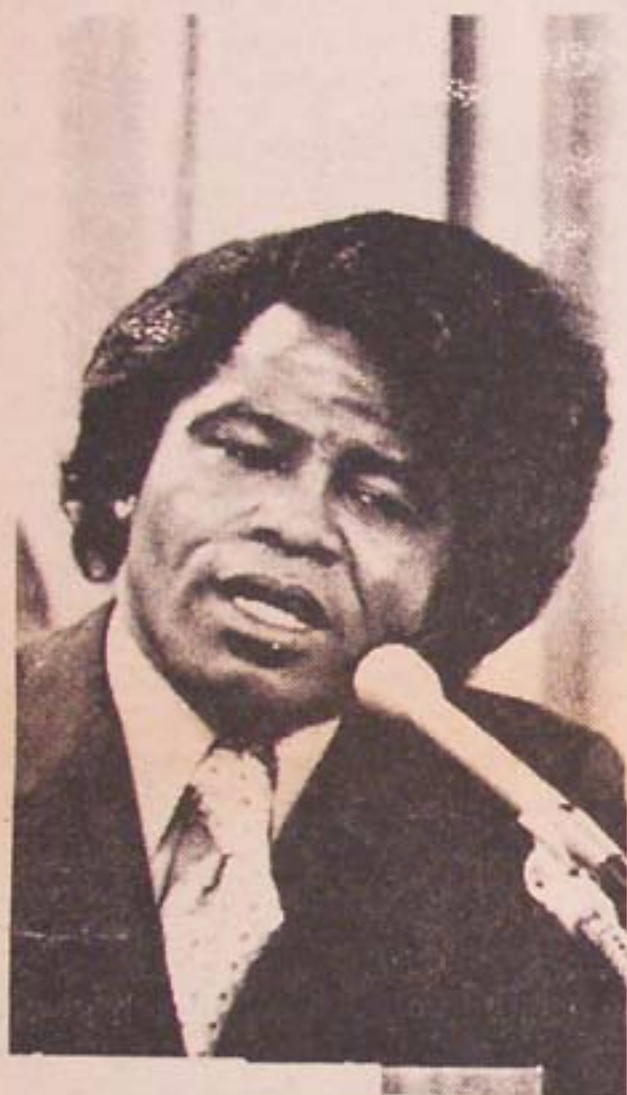
Has JAMES BROWN "souled out"?

During any presidential election year the candidates running for office or re-election are busy seeking the support, the endorsement of those people who they feel have some influence upon large numbers of people. They hope, of course, to win votes. Seldom has any candidate had to confront the idea of Black people voting in such large numbers all across the country. Now, in 1972, each candidate knows the importance of the Black vote.