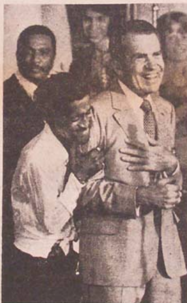
Nixon has not "embraced" the idea of freedom for Black people.

know, has done nothing at all for Black people, or any people of our underserved communities. In the four years he has been in office he has been consistent only in murdering, imprisoning and starving us. Nixon's plans never included our survival. Human life does not matter to such a man. The conditions of our Black communities everywhere clearly demonstrate this.