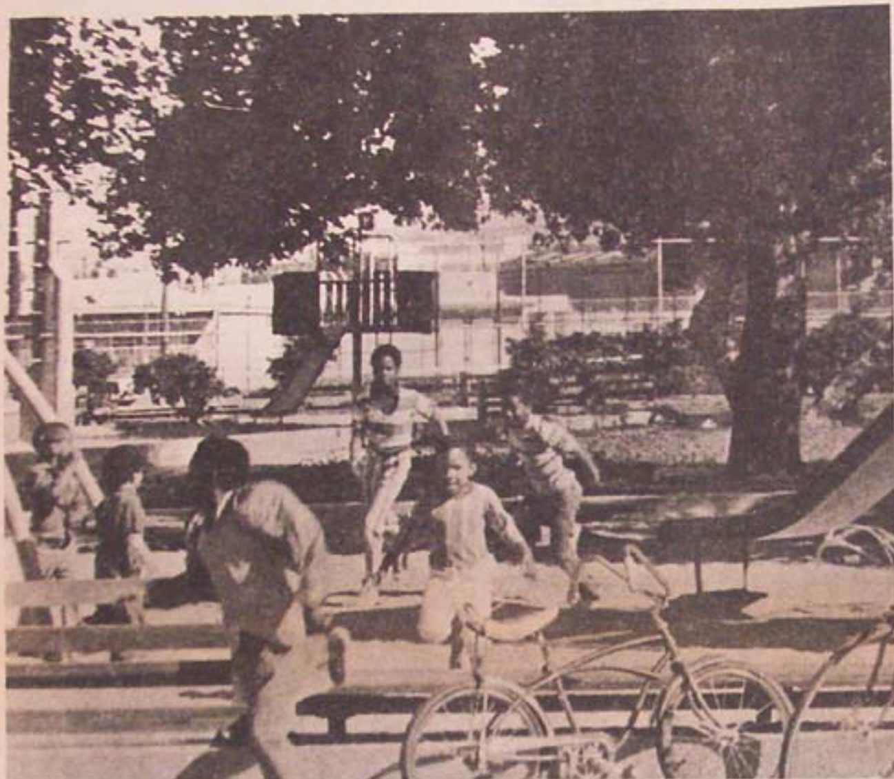
Parks and recreation facilities, schools, and the environment would all suffer if PROPOSITION 14 is allowed to pass.